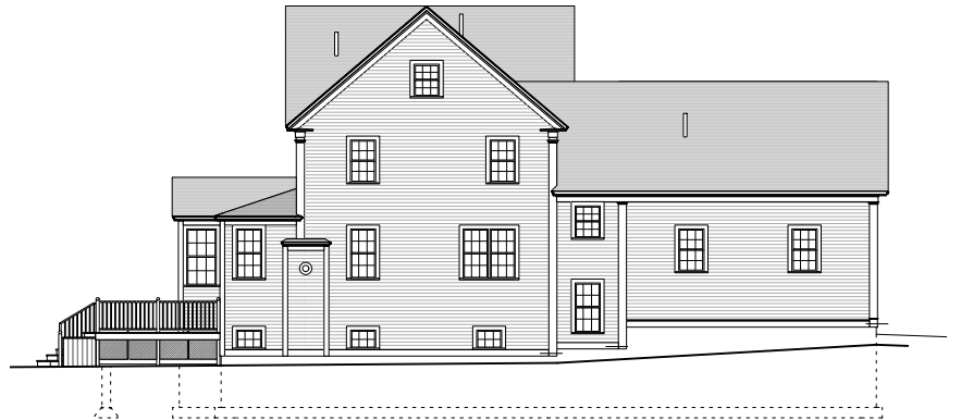
4 West Elevation