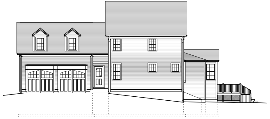
2 East Elevation