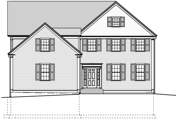
1 South Elevation