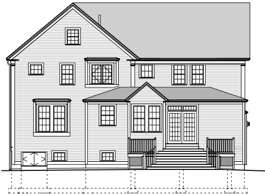
3 North Elevation